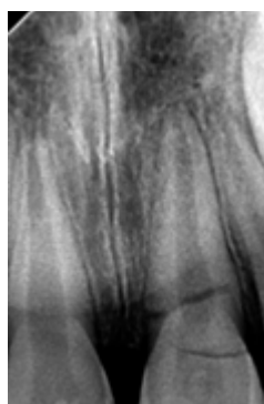
Figure 3. The state at 14 months after injury. The healing of the fractured root using mineralized tissue around the fracture line of the dental root 21