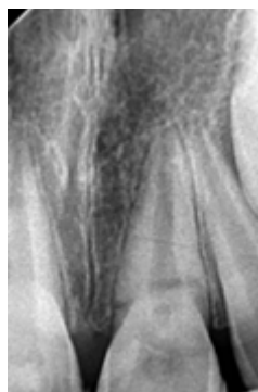
Figure 2. The state at 5 months after the injury – no signs of resorption