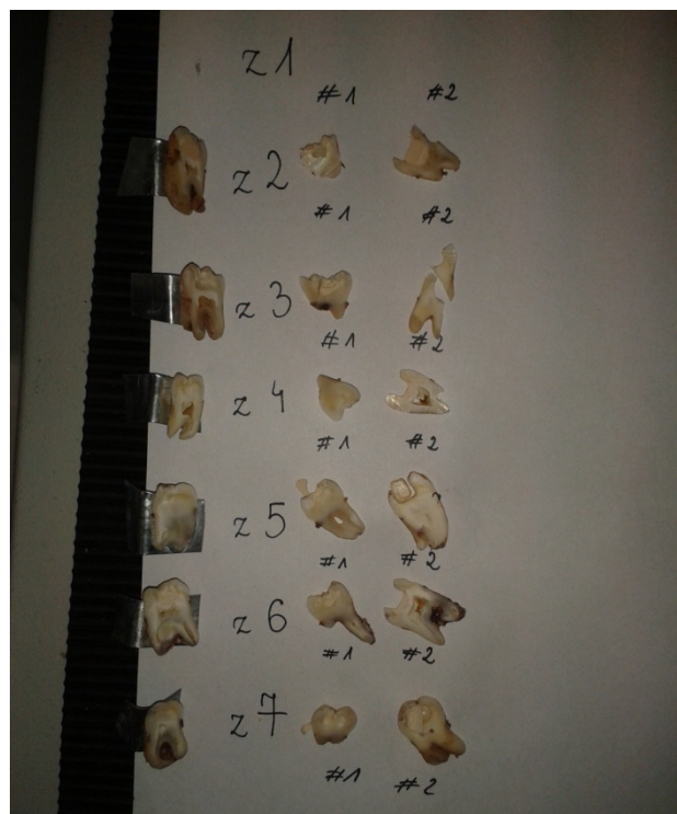
Figure 1. Image of the cut samples

into 1.0 mm thick slices, through the use of a Diamond Cutter Micracut 175, with water rinsing (Fig. 1).