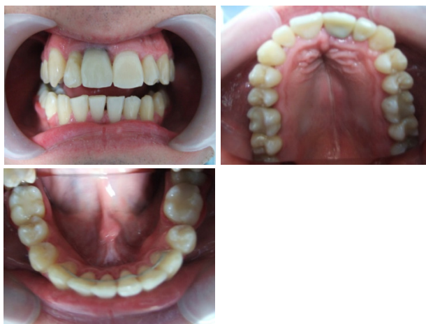
Figure 5. Intraoral view of patient's teeth after treatment procedure