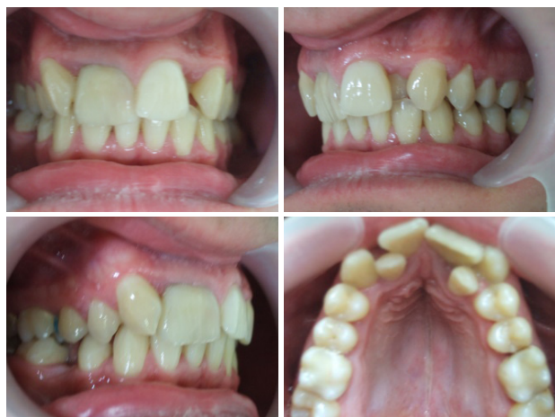
Figure 2. Intraoral view of patient's teeth before treatment procedure