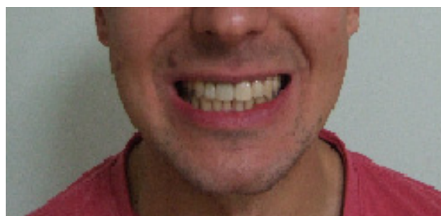
Figure 6. Internal view of patient's teeth after treatment procedure

took into account alignment of the teeth involving palatal-located teeth 12 and 22, obtaining correct relationships of teeth in the opposing arches, a symmetrical functional position of the mandible and obtaining correct relationship of vertical and horizontal biting. In the next step, it assumed the aesthetic reconstruction of tooth crown 11 and 21 with the repeated endodontic treatment of the tooth 11. After the active treatment phase, retention was scheduled in the form of upper and lower plate and the use of fixed retainers to both the upper and lower arches [5,6].