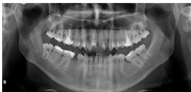
Figure 3. Panoramic radiographic image before treatment procedure